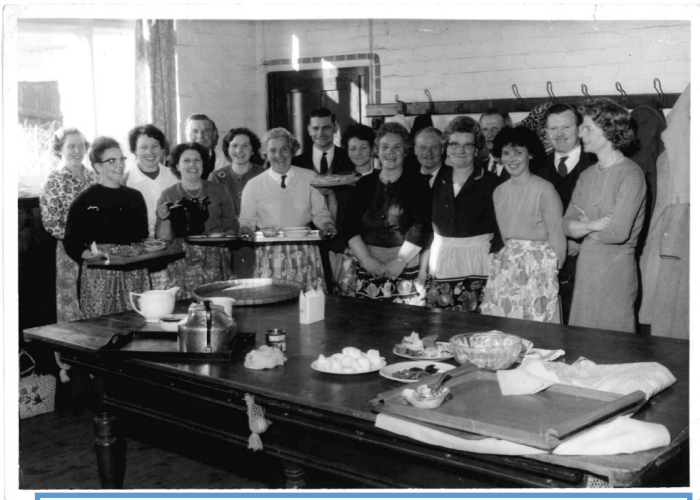
Wardington Over 60's first committee meeting